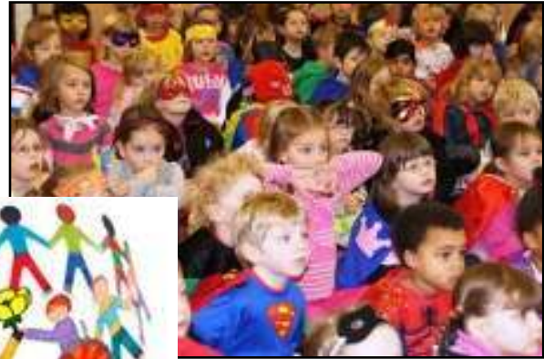
learning power together through (perseverance,