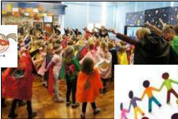
At Goldfield we are building our our four 'superpowers'

The authority's local offer of services and provision for children and young people with SEN can be accessed at www.hertsdirect.org/localoffer