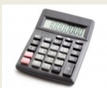
The pocket calculator