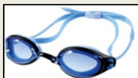
Plastic Swimming Goggles