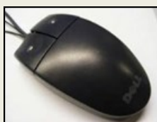
The computer mouse