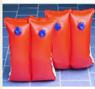
Arm bands for swimmers