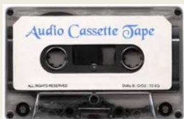
The cassette tape